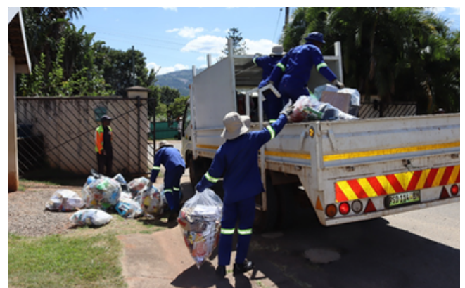
Loading recyclables from one of the gated townships

The Municipality also continued environmental monitoring of major construction projects to ensure compliance with the Environmental Management Act of 2002. Projects monitored during the quarter included the Goje Township Road Upgrade, the Central Bank of Eswatini development project, and the Medisun Clinic project.